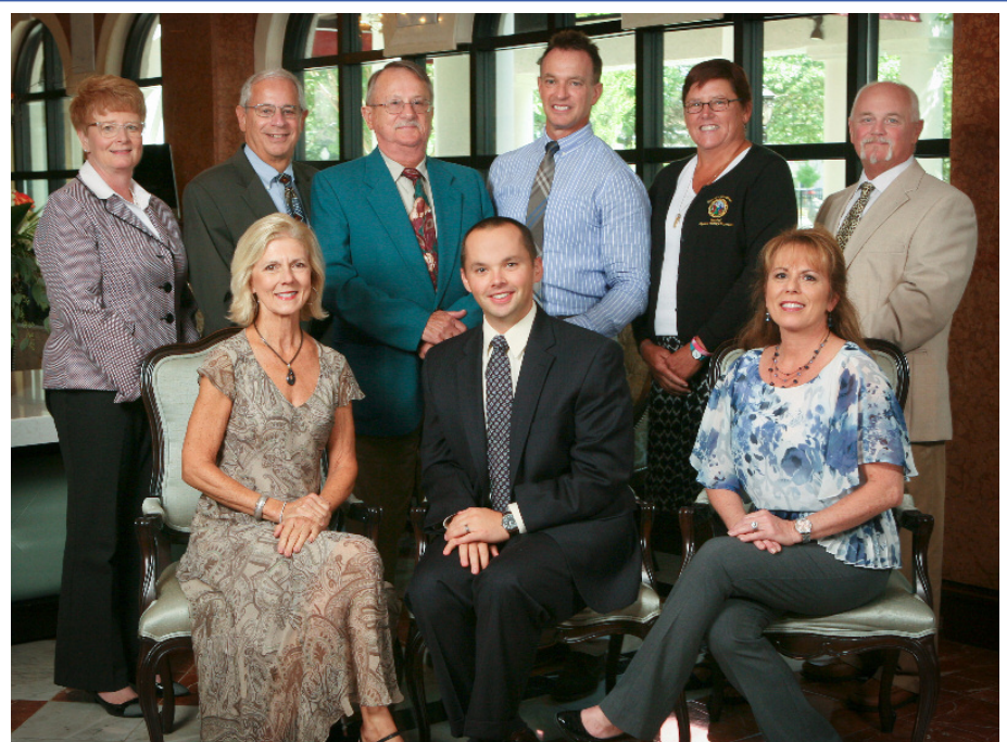
North Carolina Board of Physical Therapy Examiners – (through October 17, 2016)