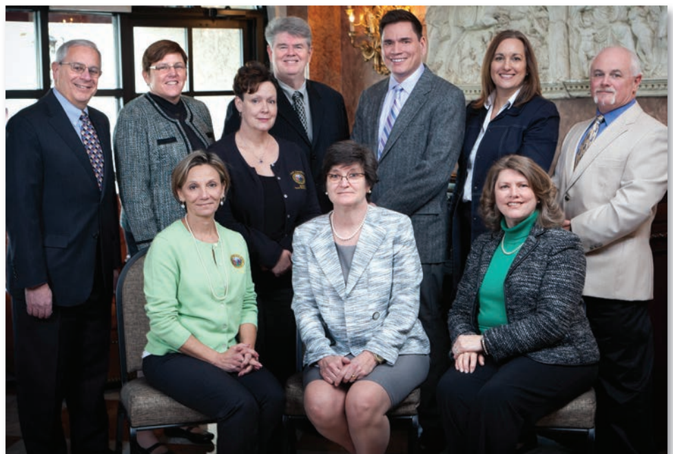
North Carolina Board of Physical Therapy Examiners - 2013